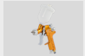
SRI Pro Lite