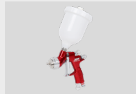
Devilbiss GTI Pro Lite