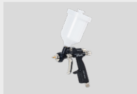
NTools FX1 mini